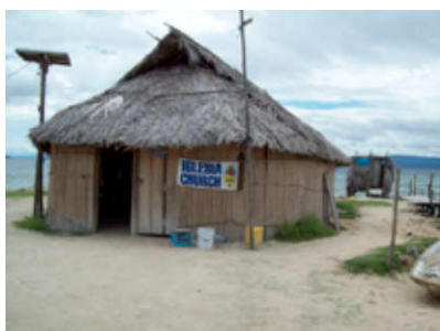
IVBI School Ancon, Panama