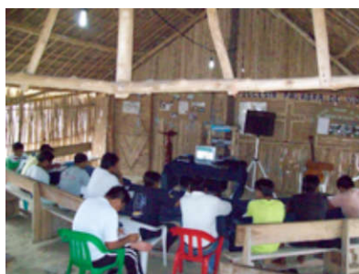
IVBI students attending Video School Ancon, Panama